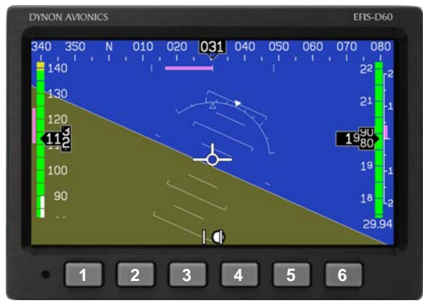
User interaction takes place via the EFIS-D60 main display and the six buttons beneath.